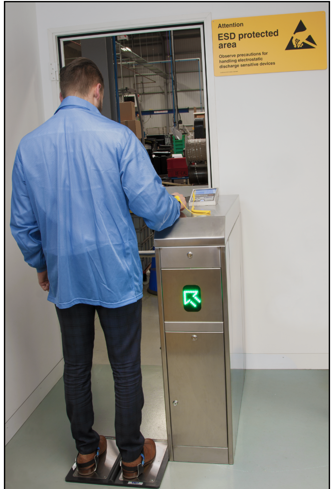
Figure 5. Performing a footwear and wrist strap test

When performing a wrist strap* test, be sure to completely plug in the wrist cord into the tester's jack.