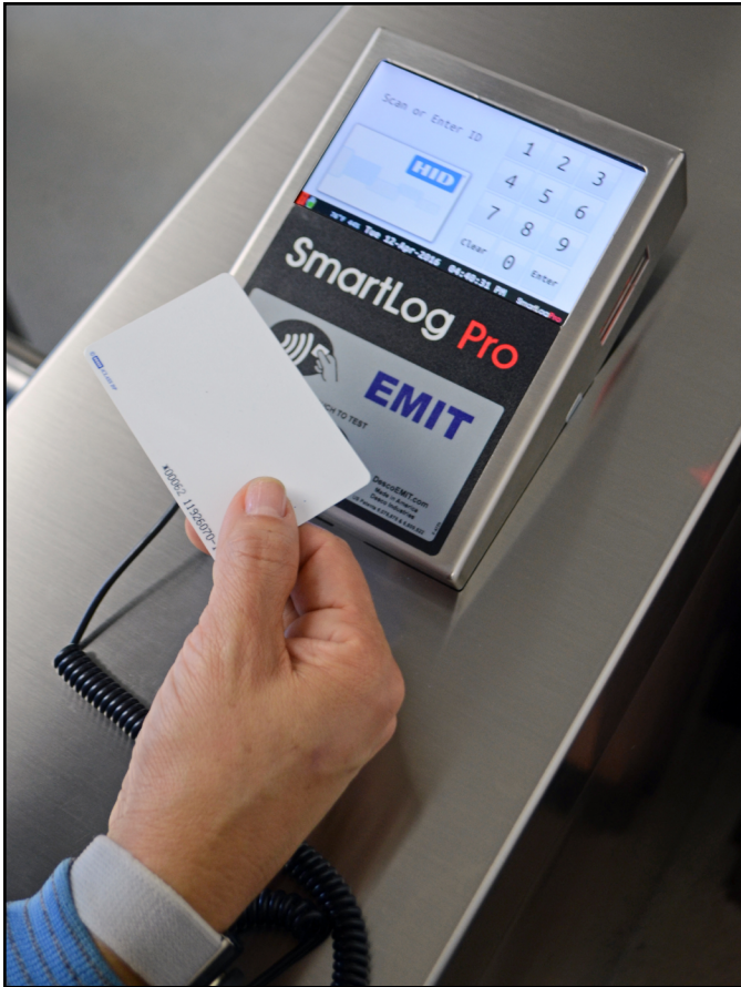
Figure 4. Holding a proximity badge in front of the RFID icon on the SmartLog Pro™