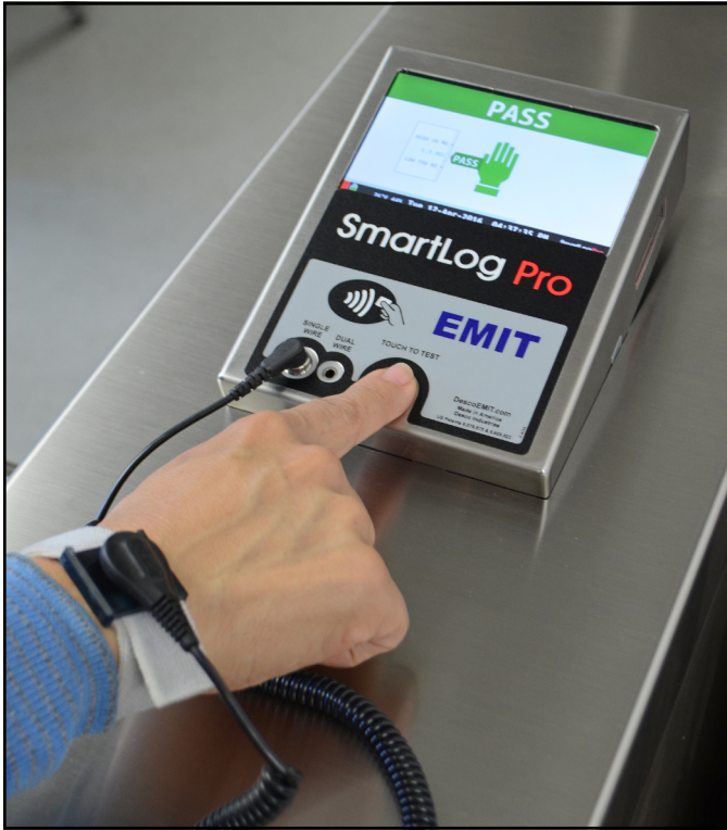
Figure 6. Performing a single-wire wrist strap test