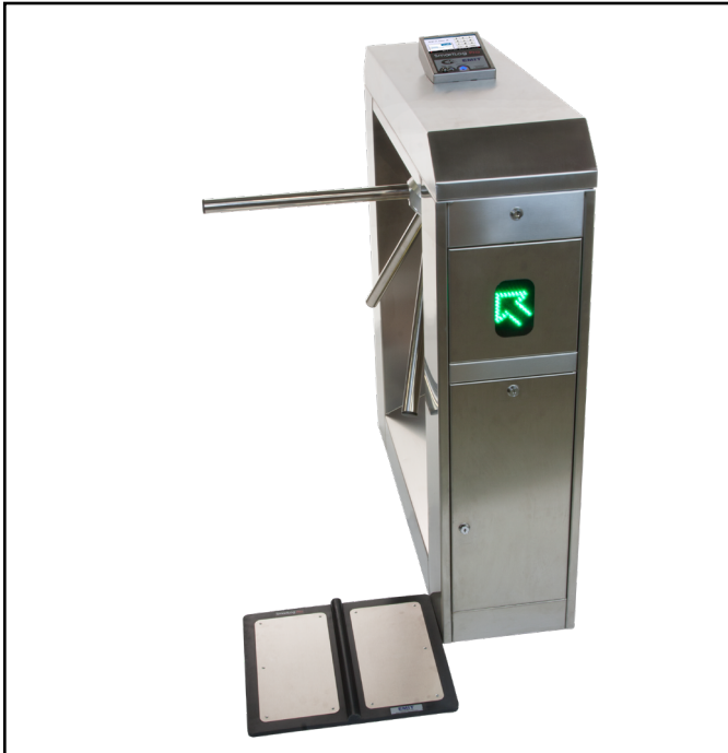
Figure 1. EMIT 50789 SmartLog Pro™ with Turnstile

Made in the United States of America and Britain