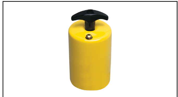
Figure 8. EMIT 50784 5-Pound Electrode for Limit Comparator