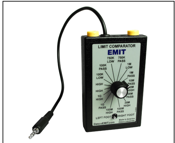
Figure 7. EMIT 50424 Limit Comparator