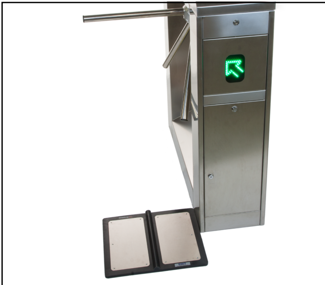
Figure 2. Installing the Dual Independent Foot Plate