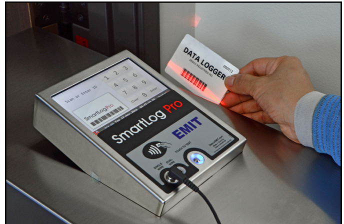
Figure 3. Using the barcode scanner

NOTE: Hold the proximity badge in front of the RFID icon for a full second if using proximity badges. See Figure 4.